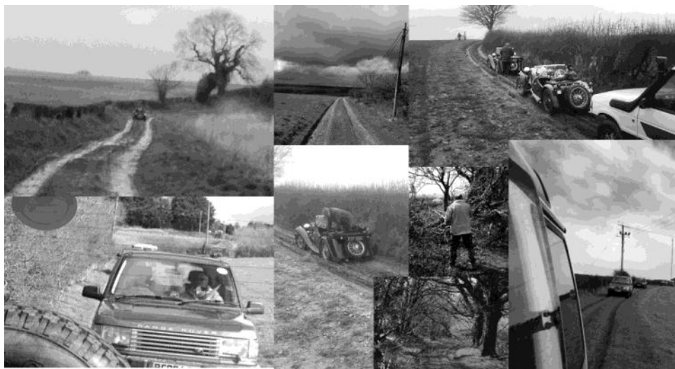
Pictures from the April GL run led by Graham Matthews - the pictures include the heavily mired MGs encountered en route!