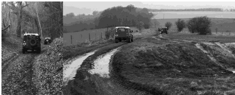
A couple more pictures from the April green laning trip