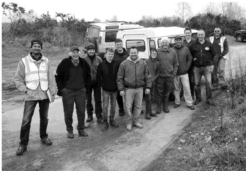
All the competitors who took part in the TYRO event at Mannington