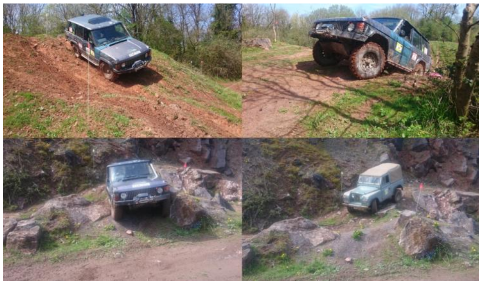
S&W RTV at Binegar