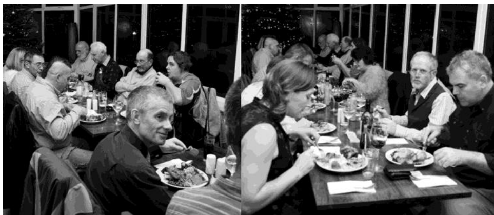
Happy diners at the Annual Awards Dinner