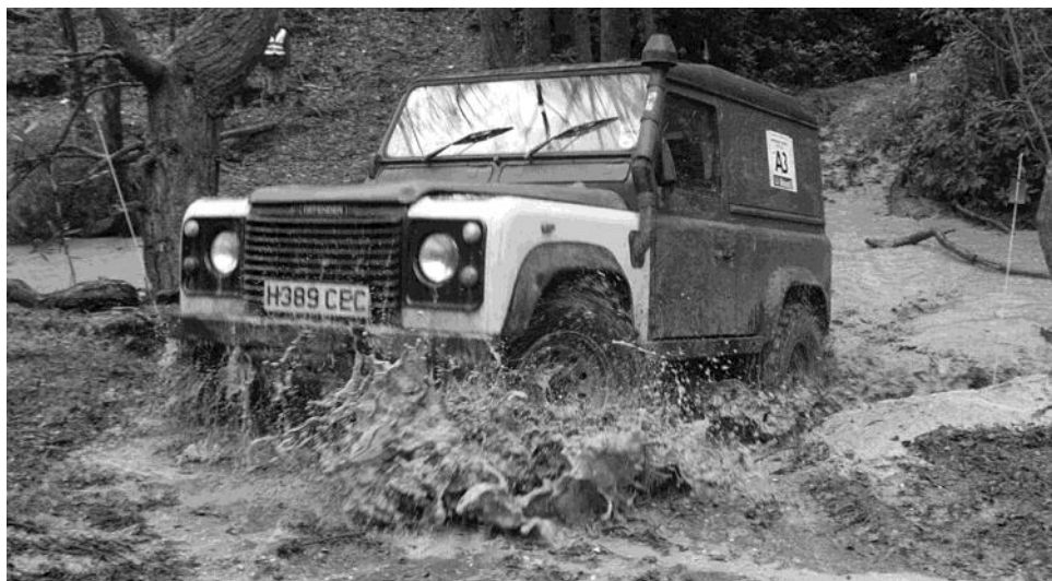
Possibly the last outing? - at Crossways in December 2015