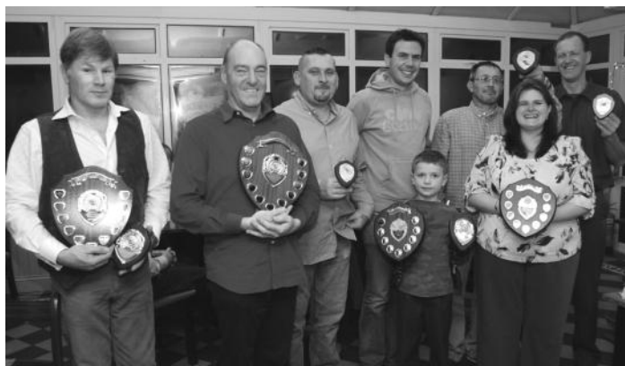
Pic below: Award winners at the dinner