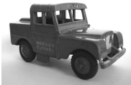
Design number 255 Mersey Tunnel police van (first issued in 1955),