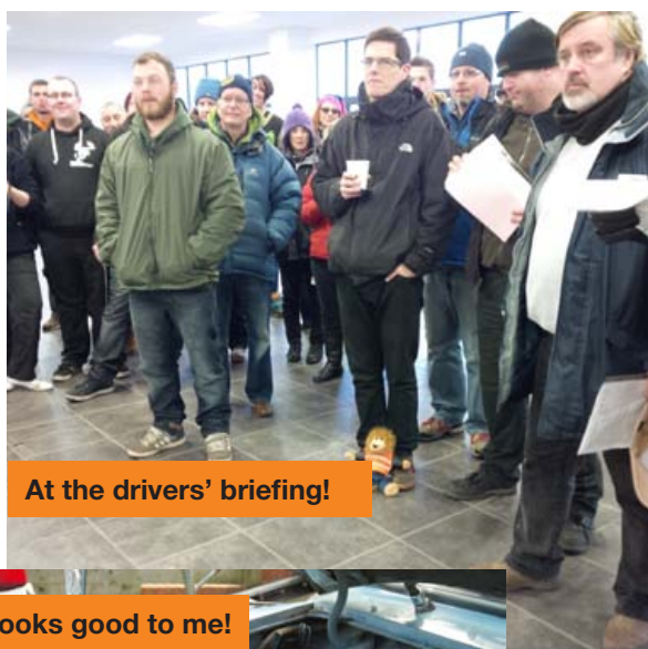
At the drivers' briefing!

Supporting the ANWCC Marshals Fund! A great scheme, visit www.anwcc.org for details!