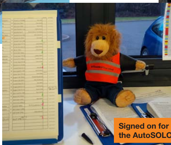
Signed on for the AutoSOLO!