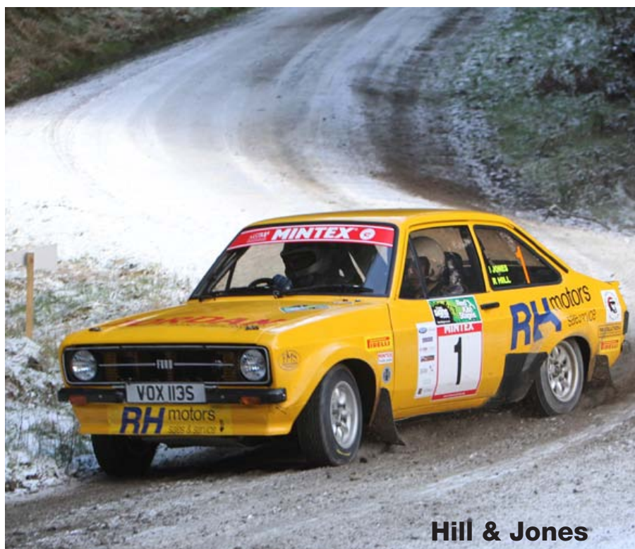
Hill & Jones