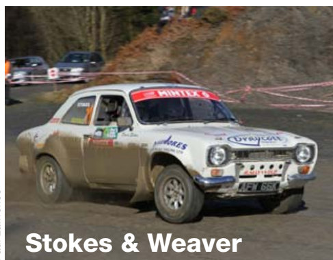
Stokes & Weaver