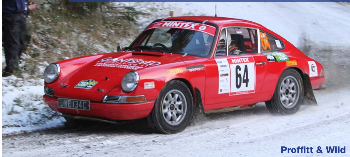
Proffitt & Wild