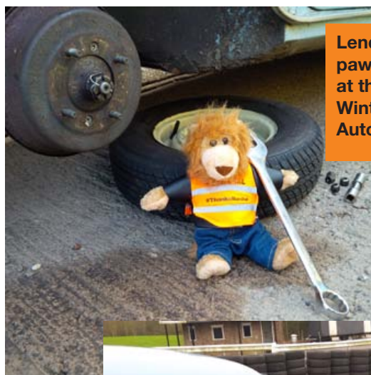
Lending a helping paw with car prep at the Donington Winterseries AutoSOLOs!